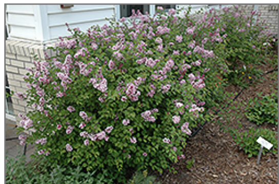
Prince Charming Lilac in bloom