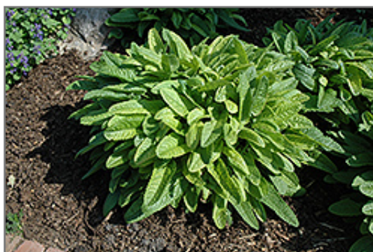
Hummelo Betony