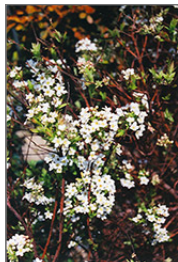
Mount Fuji Spirea flowers