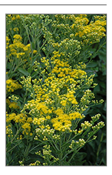
Stiff Goldenrod flowers