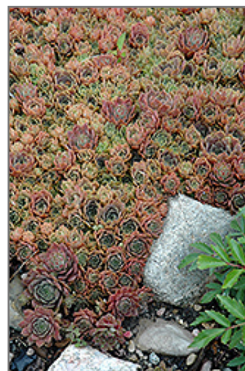
Silverine Hens And Chicks