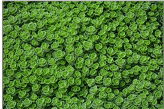
John Creech Stonecrop foliage

John Creech Stonecrop is a fine choice for the garden, but it is also a good selection for planting in outdoor pots and containers. Because of its spreading habit of growth, it is ideally suited for use as a 'spiller' in the 'spiller-thriller-filler' container combination; plant it near the edges where it can spill gracefully over the pot. Note that when growing plants in outdoor containers and baskets, they may require more frequent waterings than they would in the yard or garden. Be aware that in our climate, most plants cannot be expected to survive the winter if left in containers outdoors, and this plant is no exception. Contact our experts for more information on how to protect it over the winter months.