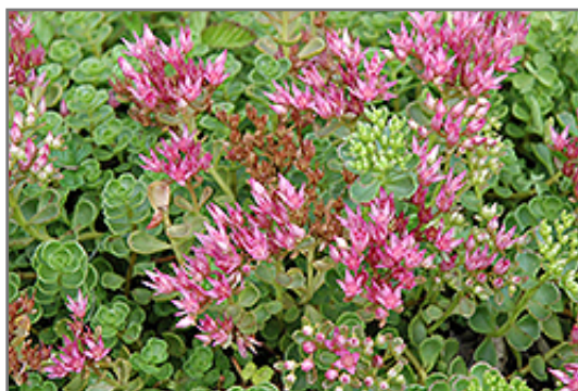
John Creech Stonecrop flowers

John Creech Stonecrop is recommended for the following landscape applications;