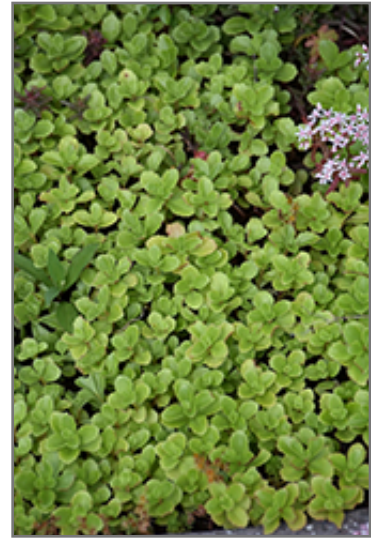
Golden Carpet Stonecrop foliage

This plant does best in full sun to partial shade. It prefers dry to average moisture levels with very well-drained soil, and will often die in standing water. It is considered to be drought-tolerant, and thus makes an ideal choice for a low-water garden or xeriscape application. It is not particular as to soil pH, but grows best in poor soils, and is able to handle environmental salt. It is highly tolerant of urban pollution and will even thrive in inner city environments. This is a selected variety of a species not originally from North America. It can be propagated by division; however, as a cultivated variety, be aware that it may be subject to certain restrictions or prohibitions on propagation.