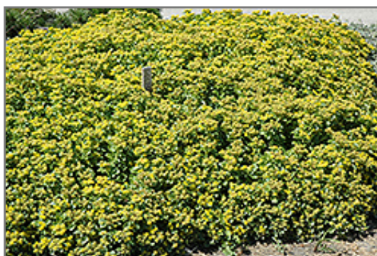
Golden Carpet Stonecrop in bloom