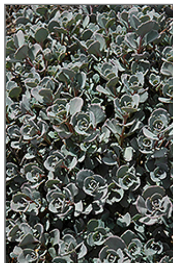
Lidakense Stonecrop foliage