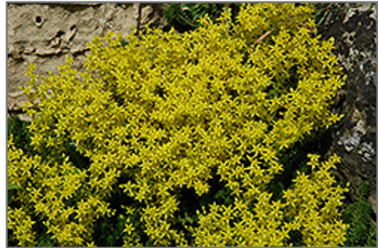
Golden Moss Stonecrop flowers

Other Names: Golden Mossy, Wall Pepper, Golden Carpet