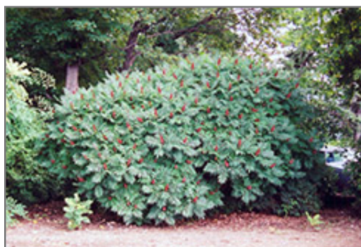
Smooth Sumac in bloom