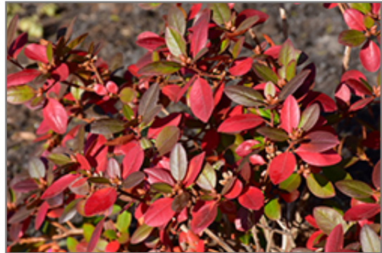
P.J.M. Rhododendron in fall

This plant is not reliably hardy in our region, and certain restrictions may apply; contact the store for more information.