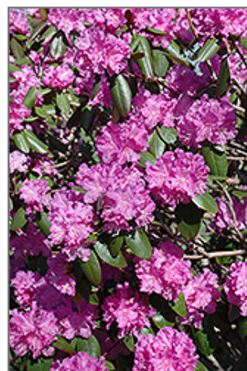
P.J.M. Rhododendron flowers