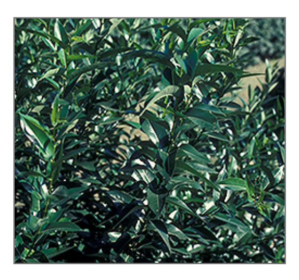
Prairie Reflection Willow foliage