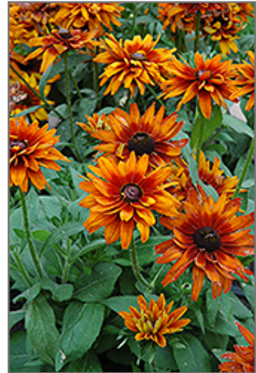
Cherokee Sunset Coneflower flowers