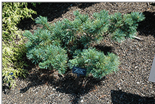
Blue Dwarf Japanese Stone Pine