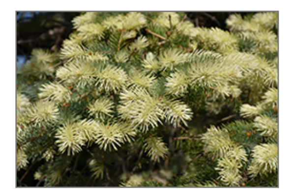
Spring Ghost Blue Spruce foliage

This is a relatively low maintenance tree. When pruning is necessary, it is recommended to only trim back the new growth of the current season, other than to remove any dieback. Deer don't particularly care for this plant and will usually leave it alone in favor of tastier treats. It has no significant negative characteristics.