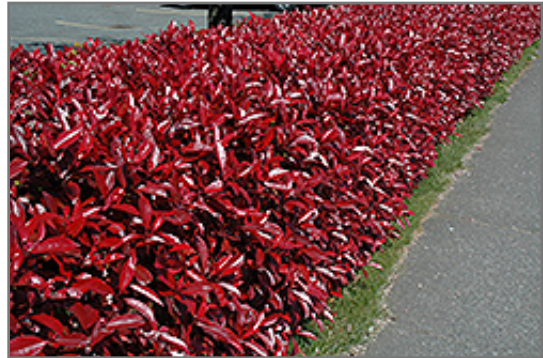
Fraser Photinia

This plant is not reliably hardy in our region, and certain restrictions may apply; contact the store for more information.