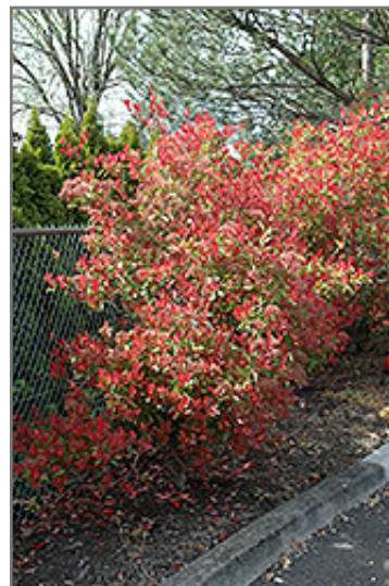
Fraser Photinia in bloom

Fraser Photinia is recommended for the following landscape applications;