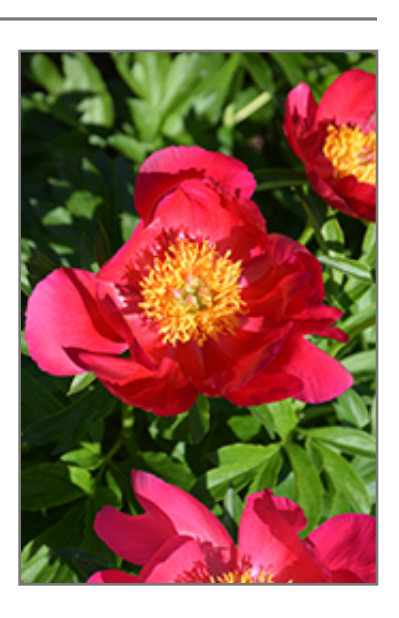
Scarlet O'Hara Peony flowers

Scarlet O'Hara Peony will grow to be about 30 inches tall at maturity, with a spread of 3 feet. When grown in masses or used as a bedding plant, individual plants should be spaced approximately 30 inches apart. The flower stalks can be weak and so it may require staking in exposed sites or excessively rich soils. It grows at a slow rate, and under ideal conditions can be expected to live for approximately 20 years. As an herbaceous perennial, this plant will usually die back to the crown each winter, and will regrow from the base each spring. Be careful not to disturb the crown in late winter when it may not be readily seen!