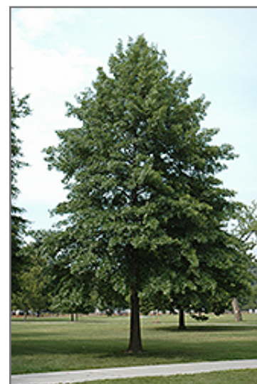
Pin Oak