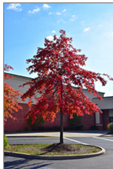
Pin Oak in fall