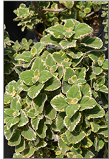
Aureus Variegatus Plectranthus foliage