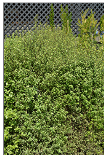
Oliver Twist Kohuhu