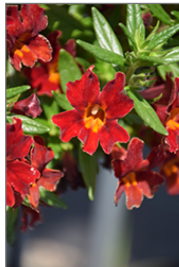
Mai Tai Red Monkeyflower flowers