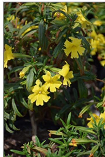
Jelly Bean Lemon Monkeyflower flowers

Jelly Bean Lemon Monkeyflower is recommended for the following landscape applications;