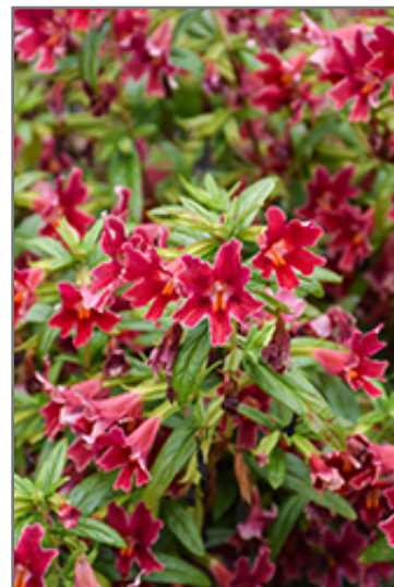
Jelly Bean Dark Pink Monkeyflower flowers

Jelly Bean Dark Pink Monkeyflower is recommended for the following landscape applications;