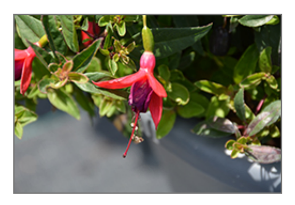
Angel Earrings Dainty Fuchsia flowers