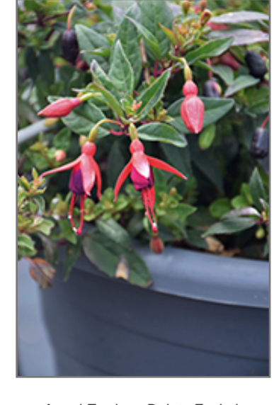
Angel Earrings Dainty Fuchsia flowers