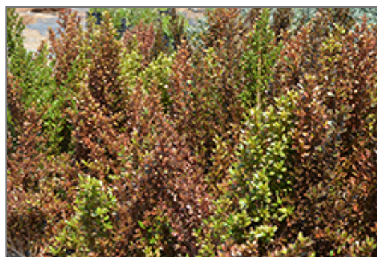
Evening Glow Mirror Bush