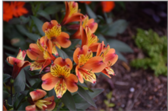
Indian Summer Alstroemeria flowers

Indian Summer Alstroemeria is recommended for the following landscape applications;