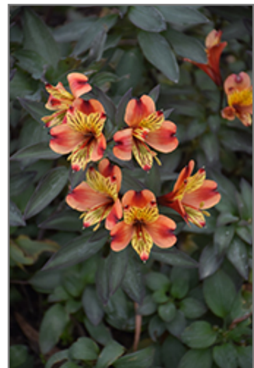
Indian Summer Alstroemeria flowers