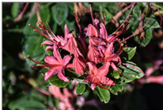
Millennium Azalea flowers