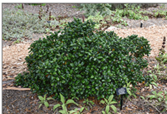
Leatherleaf Coffeeberry