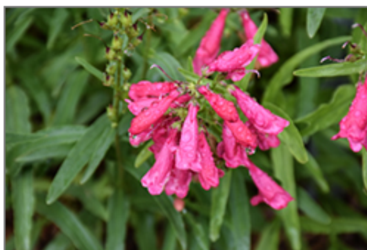
Coral Baby Beardtongue flowers