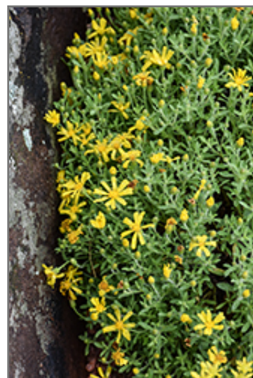
Goldhill Golden Aster flowers