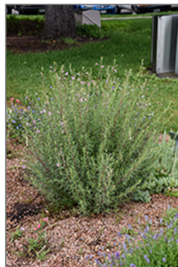
Alpine Willowherb in bloom