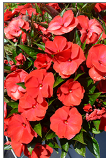
Petticoat True Red Magnum New Guinea Impatiens flowers