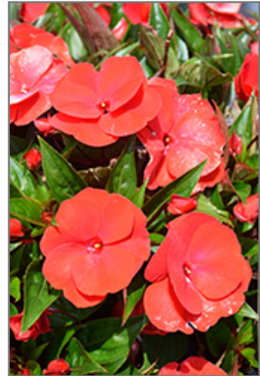
Petticoat True Red Magnum New Guinea Impatiens flowers