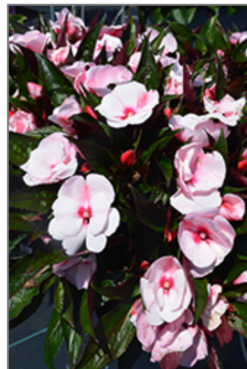
Petticoat Cherry Blossom New Guinea Impatiens flowers

Petticoat Cherry Blossom New Guinea Impatiens is recommended for the following landscape applications;