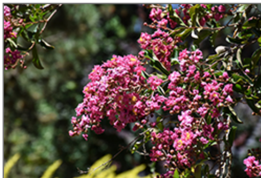
Pecos Crapemyrtle flowers

Pecos Crapemyrtle will grow to be about 12 feet tall at maturity, with a spread of 10 feet. It has a low canopy with a typical clearance of 1 foot from the ground, and is suitable for planting under power lines. It grows at a medium rate, and under ideal conditions can be expected to live for approximately 20 years.