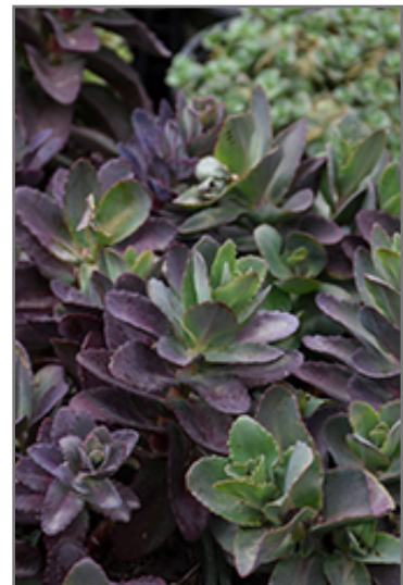
Conga Line Stonecrop foliage