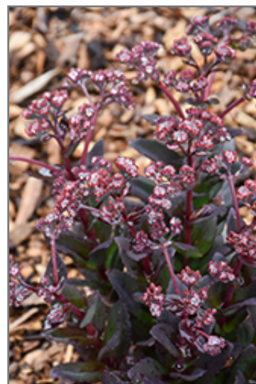
Conga Line Stonecrop flowers

This plant is not reliably hardy in our region, and certain restrictions may apply; contact the store for more information.