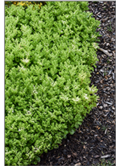
Summer Snow Stonecrop flowers

Summer Snow Stonecrop is recommended for the following landscape applications;