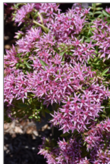
Spot On Pink Stonecrop flowers

Spot On Pink Stonecrop is recommended for the following landscape applications;