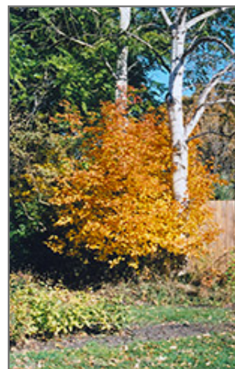
Saskatoon in fall