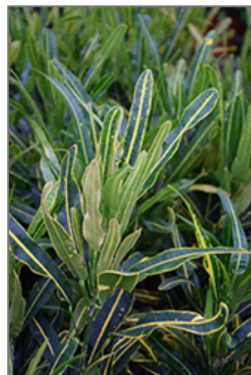
Banana Croton foliage