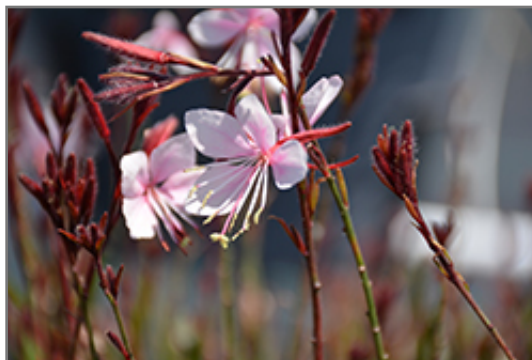
Steffi Blush Pink Gaura flowers

Steffi Blush Pink Gaura is recommended for the following landscape applications;