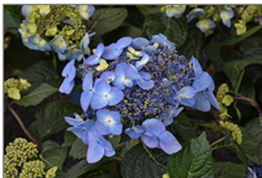
Endless Summer Pop Star Hydrangea flowers