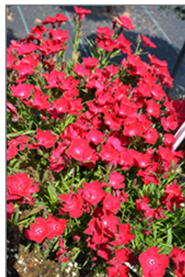
Beauties Tyra Pinks flowers