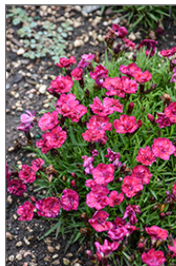
Beauties Tiiu Pinks flowers