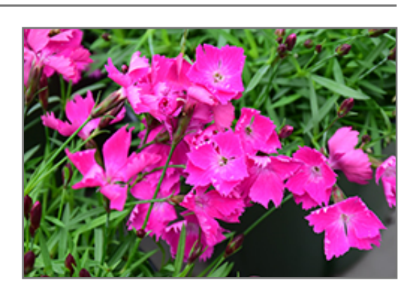
Beauties Kahori Pinks flowers