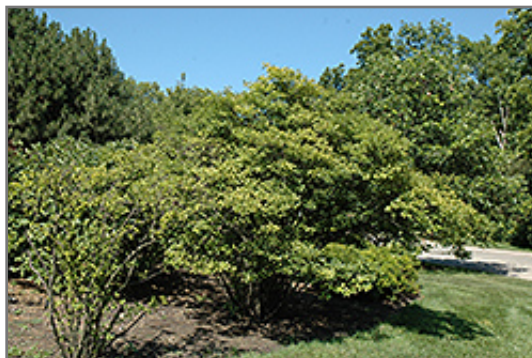
Japanese Winterberry