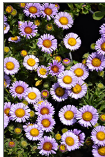
Cape Sebastian Seaside Daisy flowers