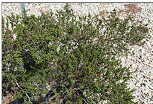
Vandenberg California Lilac