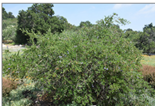
Ernie Bryant California Lilac in bloom