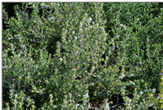
Mia's Wonder Coast Rosemary foliage