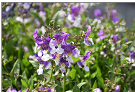
Serafina Bicolor Angelonia flowers

Serafina Bicolor Angelonia is recommended for the following landscape applications;